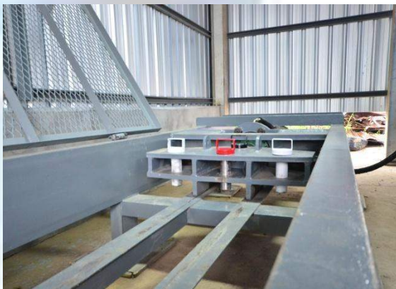
Load pins for different angles.