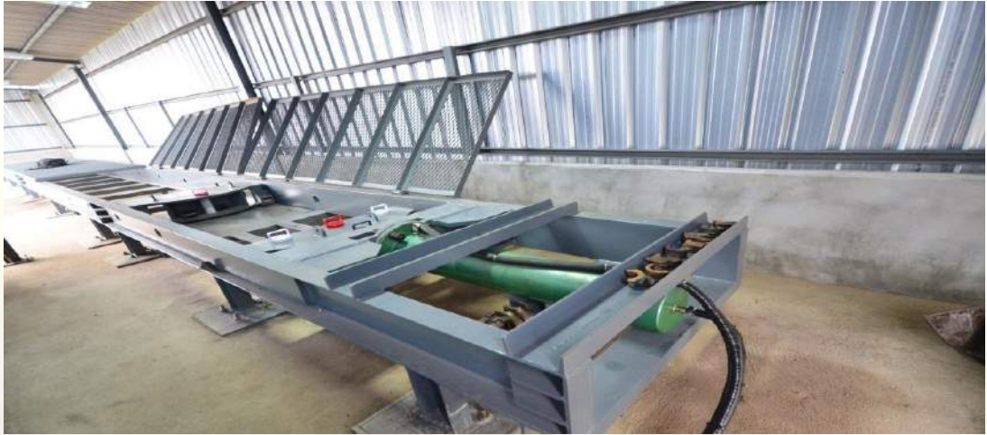
Fully adjustable beds for various length ropes & cables.