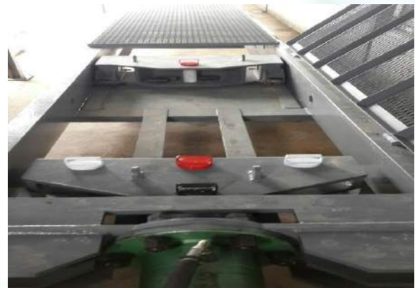
Large effective bed clearance enables testing of a wide range of specimens.